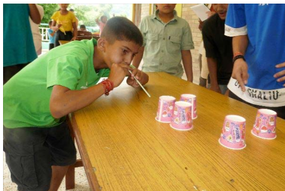
table tennis balls were shoveled blindfolded, and paper cups were blown across the table.